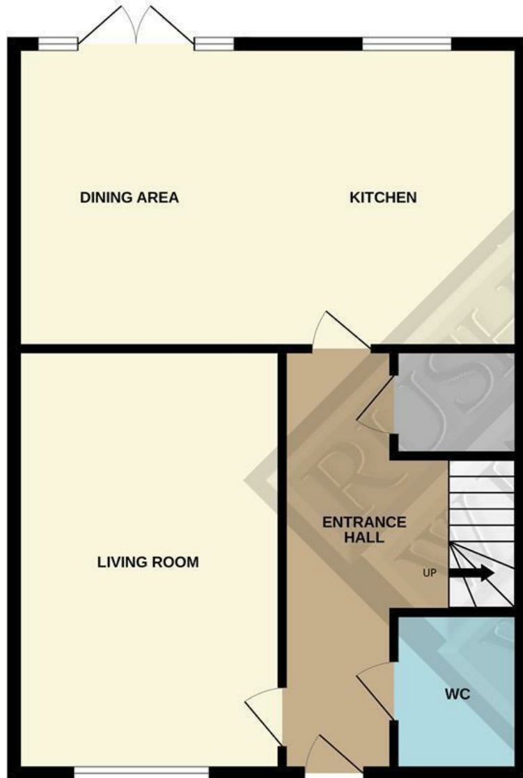
GROUND FLOOR 675 sq.ft. (62.7 sq.m.) approx.